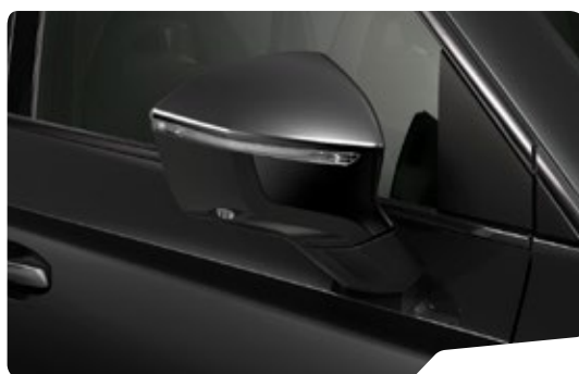
↓ MAGIC BLACK - 1Z1Z (Metallic)