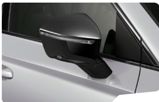
↓ NEVADA WHITE - 2Y2Y (Metallic)