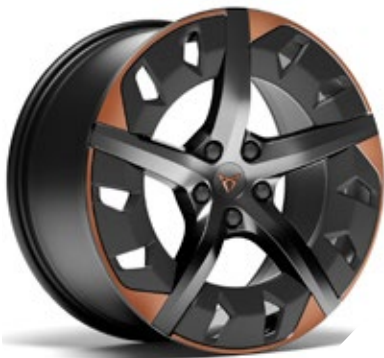
19IN AERO MACHINED SPORT BLACK / COPPER (P9C) ■