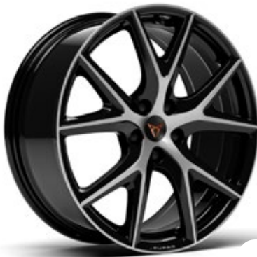
19IN MACHINED R SPORT BLACK / SILVER (PUW) ■