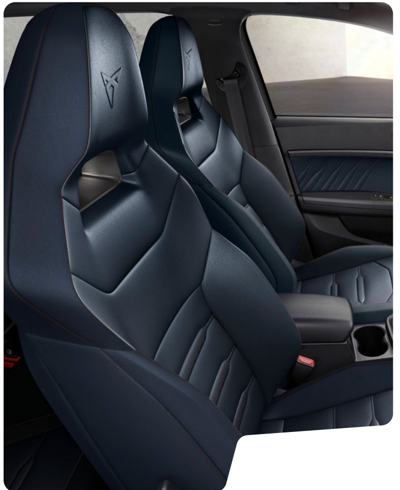
↓ PETROL BLUE LEATHER INTERIOR ■