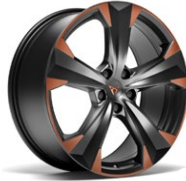
19IN MACHINED SPORT BLACK / COPPER (P8A) ■