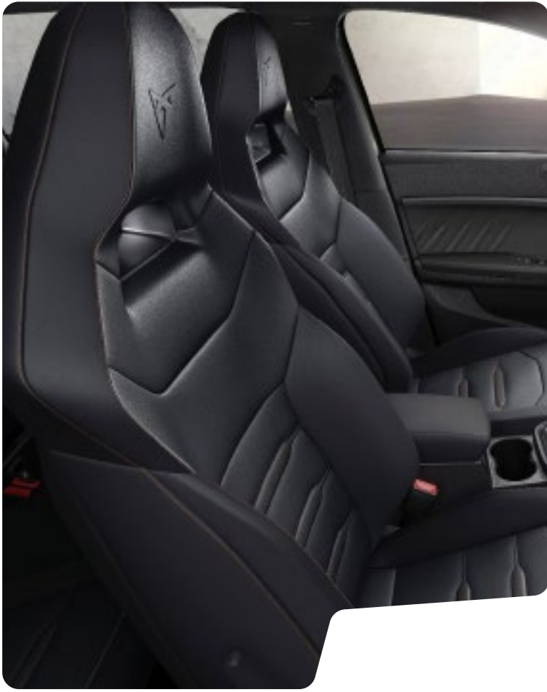
↑ BLACK LEATHER INTERIOR ■