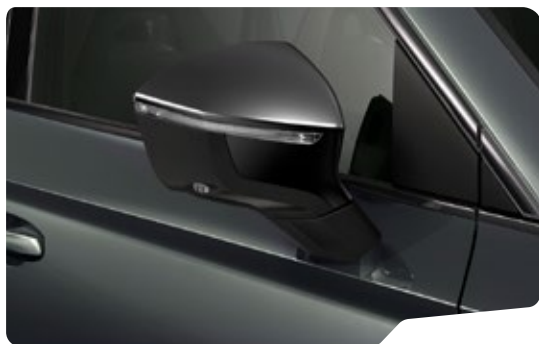
↓ DARK CAMOUFLAGE - 9S9S (Premium Metallic)