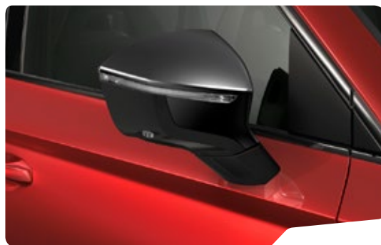
↓ VELVET RED - K1K1 (Premium Metallic)