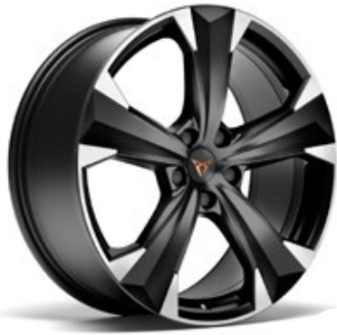
19IN MACHINED SPORT BLACK / SILVER ■