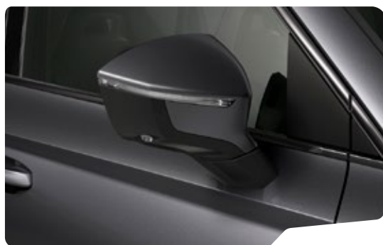
↓ GRAPHITE GREY - 5X5X (Metallic)