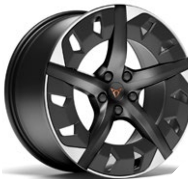
19IN AERO MACHINED SPORT BLACK / SILVER (P8V) ■