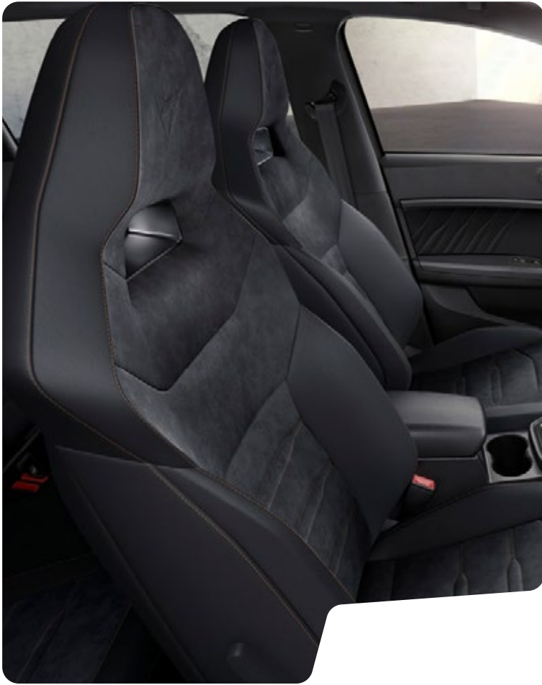
↑ BLACK ALCANTARA INTERIOR ■