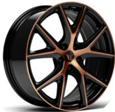
19IN MACHINED R SPORT BLACK / COPPER (PYA) ■