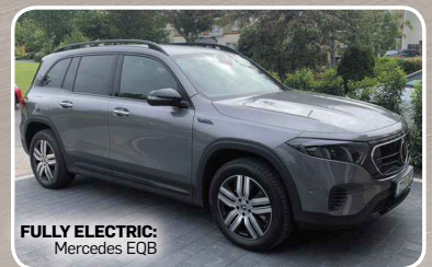
FULLY ELECTRIC: Mercedes EQB