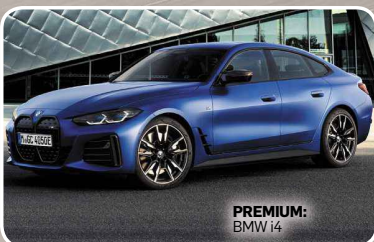
PREMIUM: BMW i4