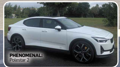
PHENOMENAL: Polestar 2