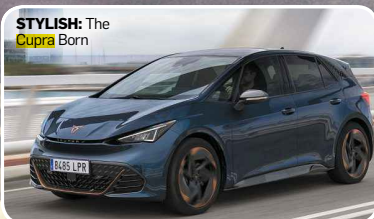
STYLISH: The Cupra Born