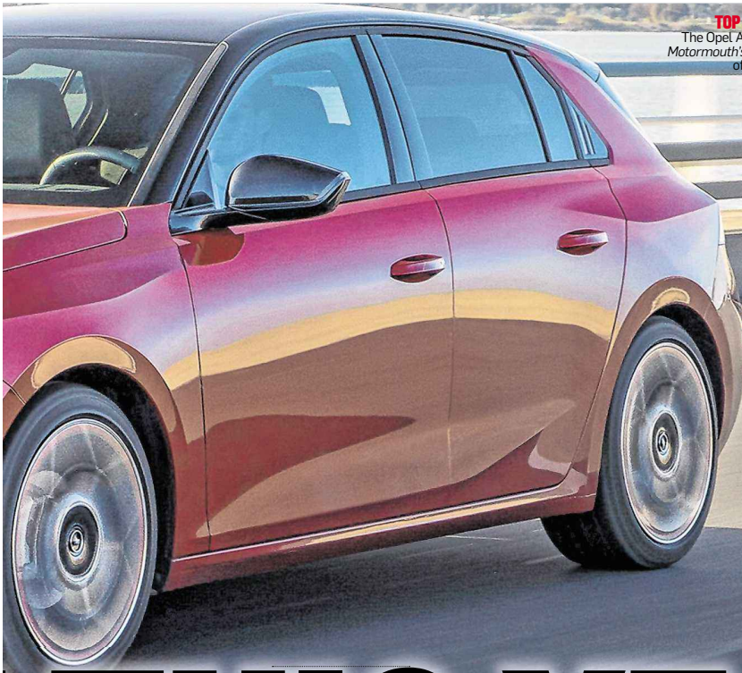
TOP BILLING The Opel Astra was Motormouth's No.1 car of the year