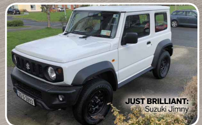
JUST BRILLIANT: Suzuki Jimmy

I spent most of my week in November telling people that this wasn't the full Range Rover and only the 'Sport' version. This new Plug-In Hybrid iteration comes with all the bells and whistles and will cost you north of €110k even for the entry level model, but it is truly fabulous in every way. If money was no option, this is on my new 'fictitious' car list.