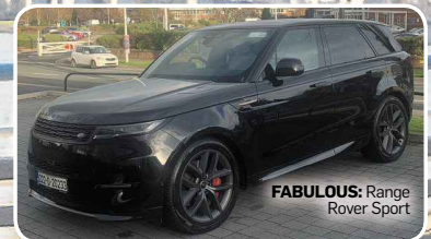
FABULOUS: Range Rover Sport