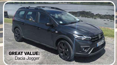
GREAT VALUE: Dacia Jogger