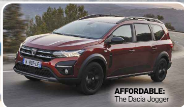
AFFORDABLE: The Dacia Jogger

Media Source Press Page 38,39 Circulation 114,854 Topic Volkswagen Passenger SEAT Cupra