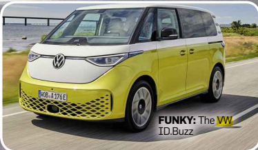
FUNKY: The VW ID.Buzz